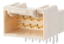
Right-Angle Header, Gold Plated