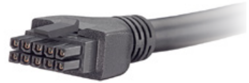
Micro-Fit Overmolded Cable Assembly (10-Circuit Version Shown)

Provides quick availability for development and production programs and customized versions for final designs