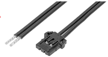
Pico-Lock 2.0 Cable Assemblies

OTS Pico-Lock 2.0 Cable Assemblies offer 1.00, 1.50 and 2.00mm-pitch versions in a variety of cable lengths and provide durable locking for secure mating retention