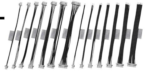
OTS DuraClik ISL SR Sn Discrete-Wire Cable Assemblies

OTS DuraClik ISL SR Sn Discrete-Wire Cable Assemblies deliver up to 3.0A and a variety of circuit sizes to facilitate both prototyping and global preproduction